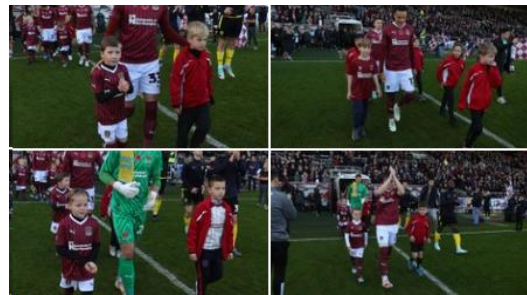
OPS at the Cobblers