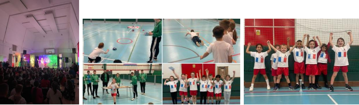
Pantomime in school