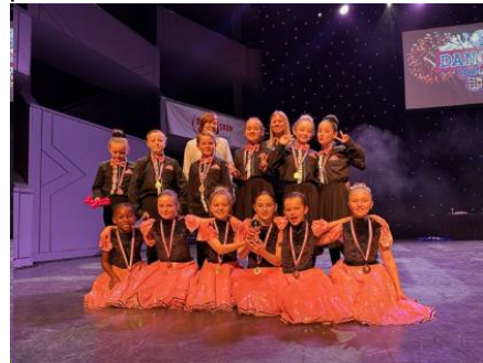
Strictly at the Dengegate Theatre